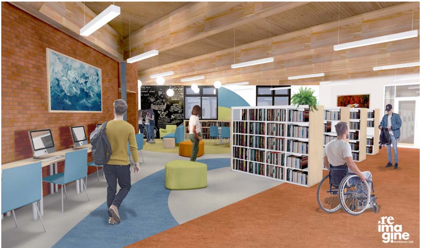
Teen Zone in Expanded Area